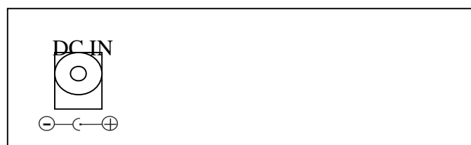
Fig. 2: Rear View