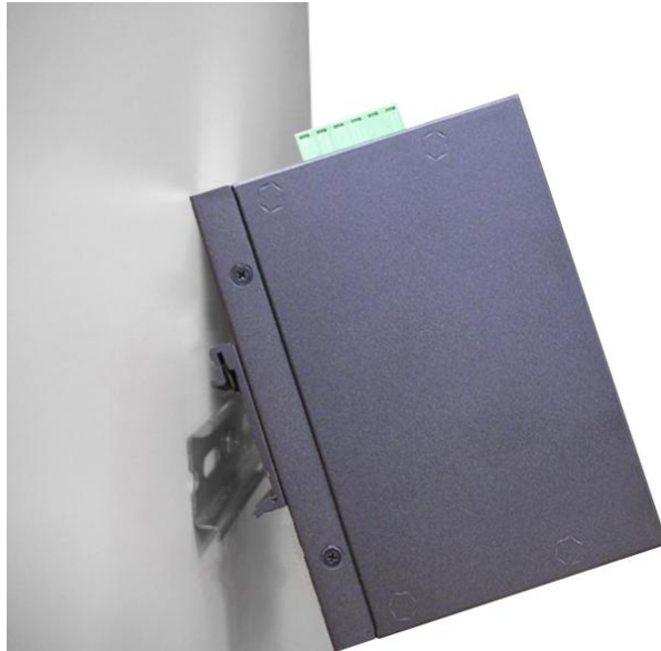
Fig. 3: Installation to DIN-Rail Step 1