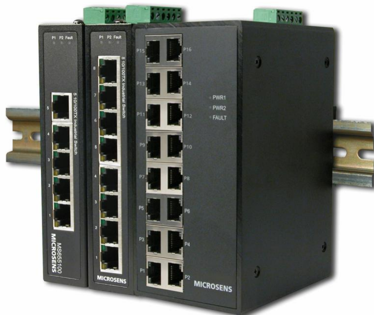
Fig. 1: Entry Line Fast Ethernet Switches

All new devices distinguish themselves with easy handling (Plug&Play) and do not need extensive configuration. New developments are focusing on increasing the port numbers and further implementation of Gigabit Ethernet.