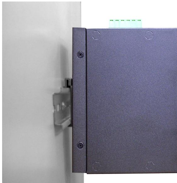
Fig. 4: Installation to DIN-Rail Step 2